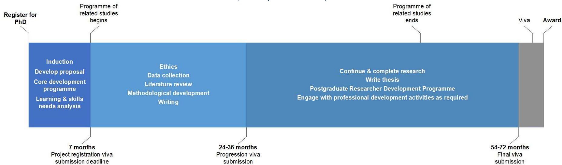
PhD timeline (based on part-time enrolment)