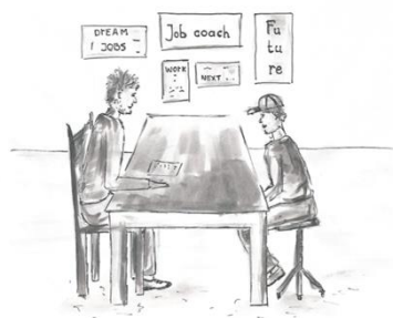
Reflective Career Dialogues are Important to Remain Employable (Delfos, 2009; Kuijpers, 2012)

'My boss said: 'You can continue to work with us.' My motivation...they evaluate my achievement positively.'