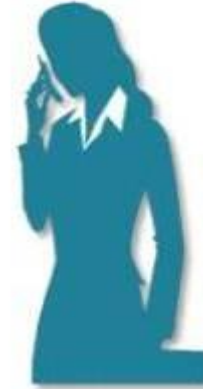
Partnership Quality Officer: PQO