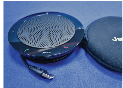
USB conference mic and speaker