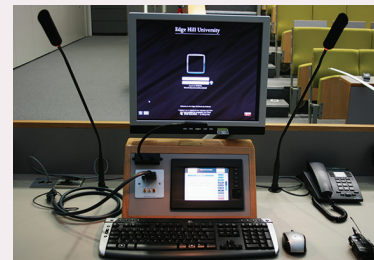
Faculty of Health & Social Care H1