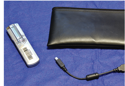
Digital voice recorder