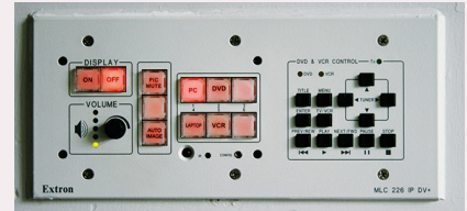
Extron push-button wall/desk-mounted control interface