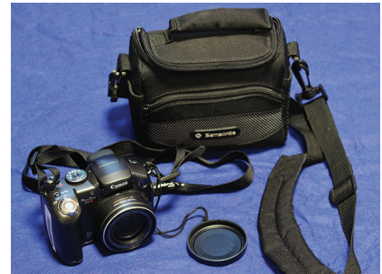
Digital stills camera