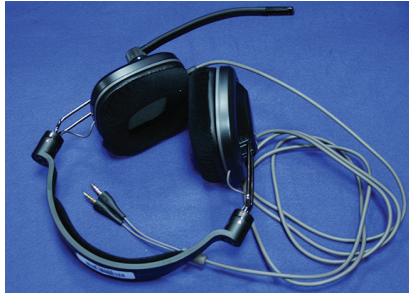
Audio headphone with microphone