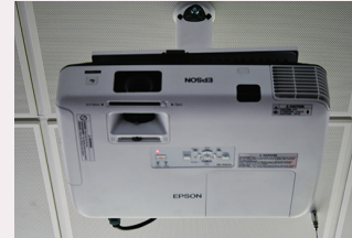
HD data projector