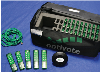
Optivote voting system (3 sets of 32, can be used for bigger classes)