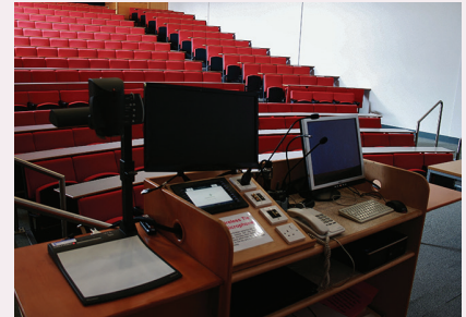
Wilson Centre W1