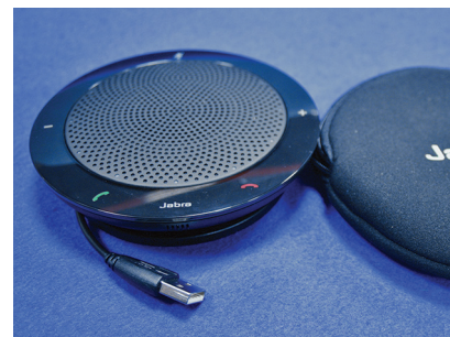
USB conference mic and speaker