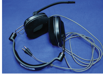
Audio headphone with microphone