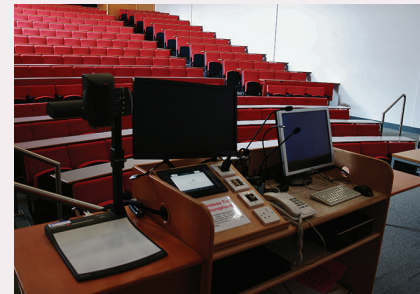
Wilson Centre W1