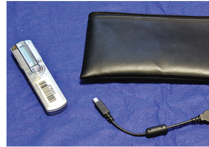
Digital voice recorder