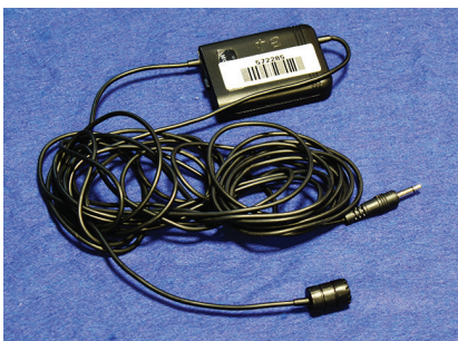
Microphone tie clips