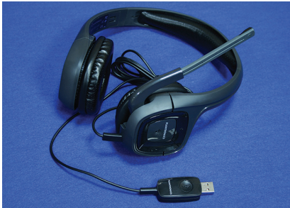
USB headphones with microphone