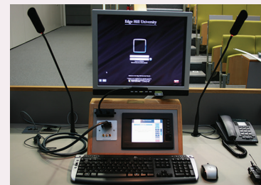
Faculty of Health & Social Care H1