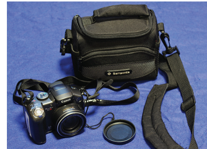
Digital stills camera