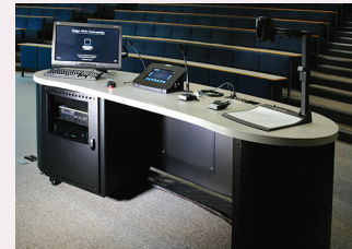
Faculty of Education E1

For details of all teaching spaces go to Y:\Everyone\Classroom Support & AV