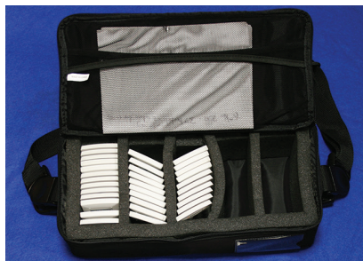
Turning point voting system (at least 35 handsets)