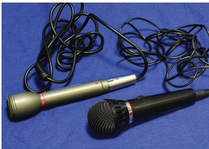
Hand microphone: XLR or 3.5mm