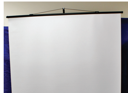
Screen and data projector