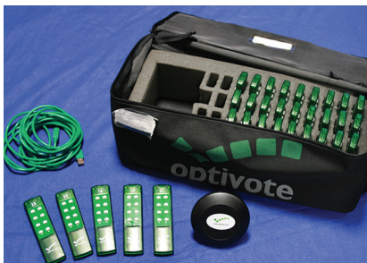
Optivote voting system (3 sets of 32, can be used for bigger classes)