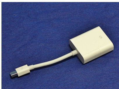
VGA adapter: Mac Book

To see the full range of portable items for loan go to the library catalogue library.edgehill.ac.uk and do a title search for 'general issue'.