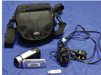
Digital camcorder (SD card)