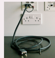
VGA style lead