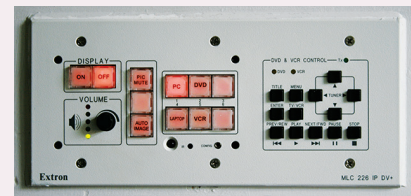
Extron push-button wall/desk-mounted control interface