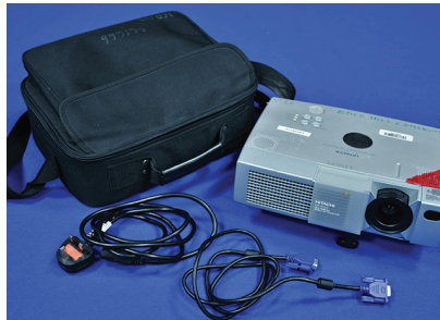
Data projector kit