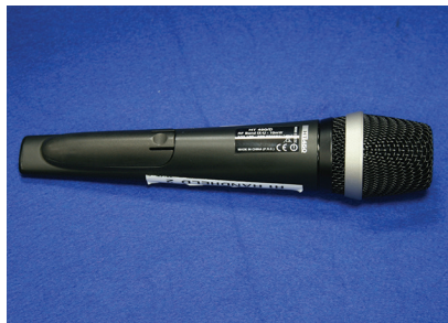
Lecture theatre wireless hand mic