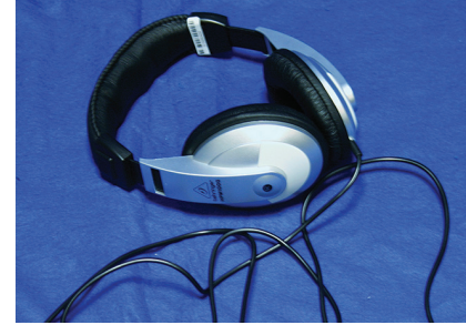
Audio headphones 3.5mm