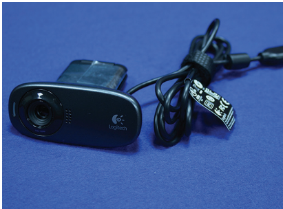
USB web cam