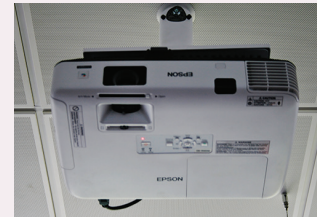
HD data projector