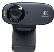
Logitech C310 HD Webcam

BT Business Direct (efin code: DAB489). £26.66 (quicklinx: 736KWS00)