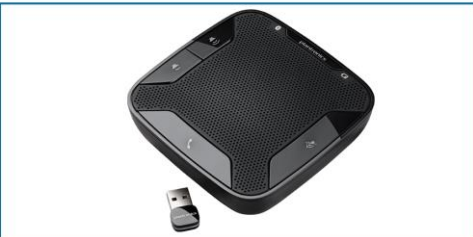
Plantronics Audio 620 USB Speakerphone

BT Business Direct (efin code: DAB489). £70.55 (quicklinx: 8G29WS00)