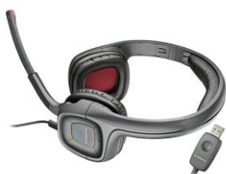
Plantronics Audio 655 USB PC Headset

BT Business Direct (efin code: DAB489). £23.78 (quicklinx: 6NSSWS00)