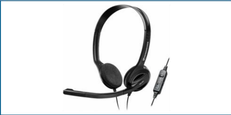
Sennheiser PC 36 USB Headset

BT Business Direct (efin code: DAB489). £28.67 (quicklinx: 8RJKWS00)