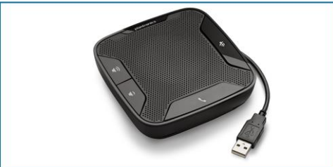
Plantronics Audio 610 USB Speakerphone

BT Business Direct (efin code: DAB489). £56.29 (quicklinx: B3TVWS00)